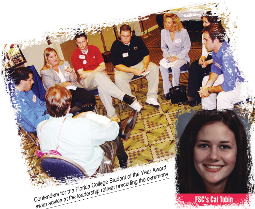
Contenders for the Florida College Student of the Year Award swap advice at the leadership retreat preceding the ceremony.