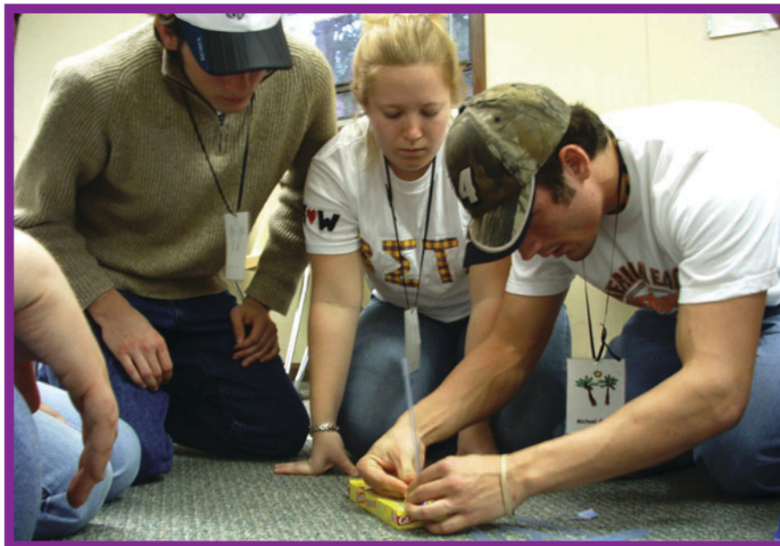
Hit the Deck: USF's Emerging Leaders are floored by some of the activities during the annual conference. Exercises like these teach students to embrace leadership roles both on campus and off.